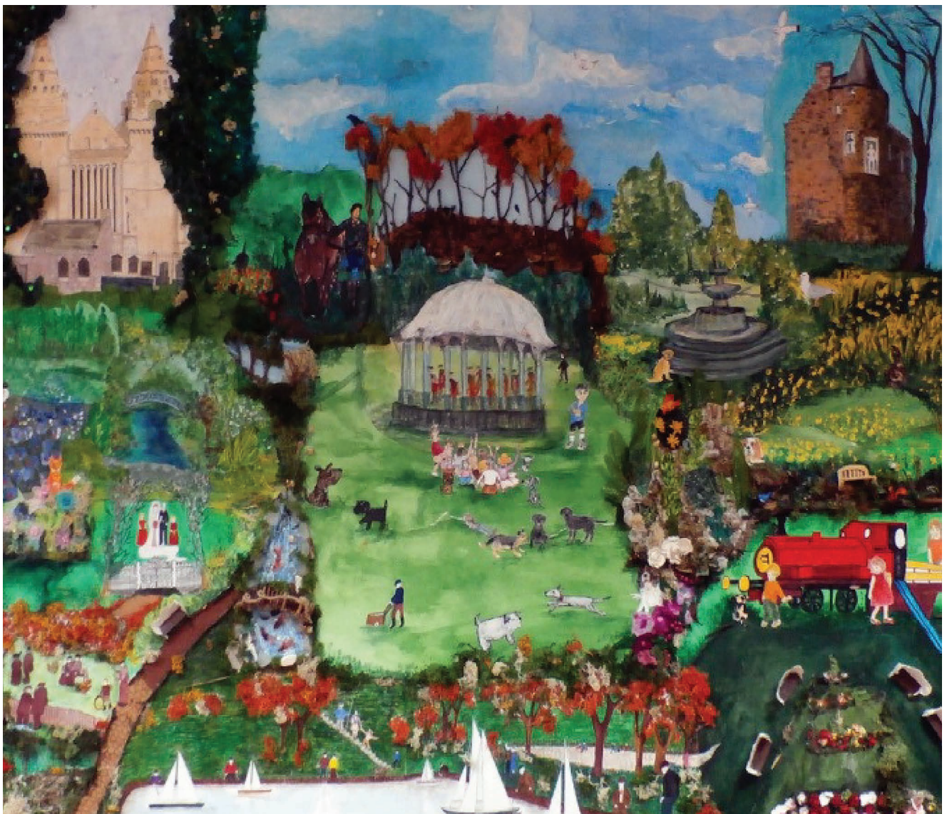
Collages created by our art group which are now displayed in our café at John Street